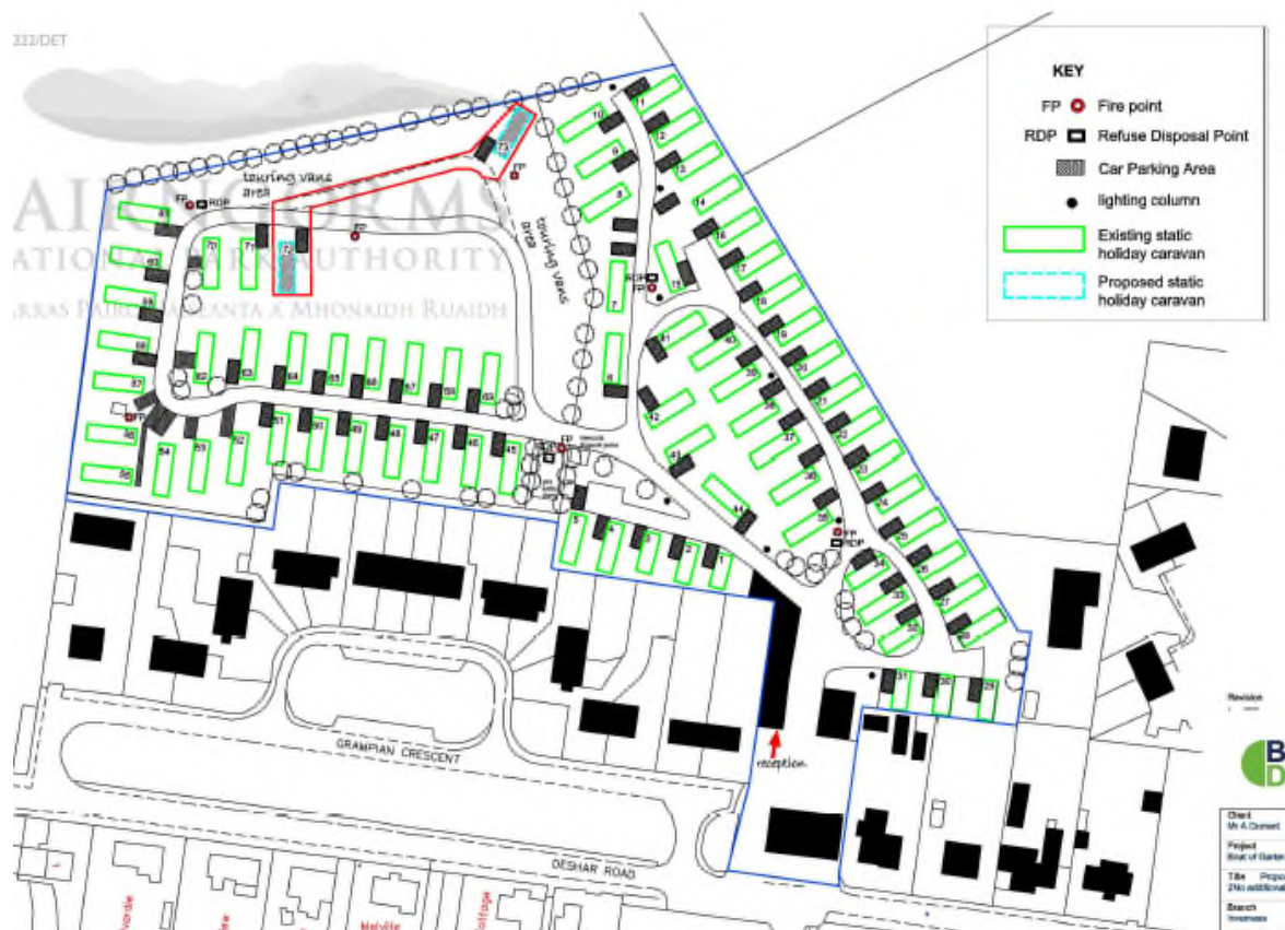
Fig. 2: Site Layout